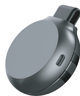
Magnetic Wireless Charger