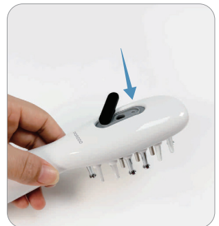
3. Close the lid