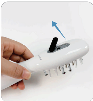
1. Open the lid