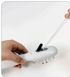
2. Add nutrients