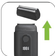
2. Detach the Razor Body