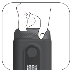
1. Pull Up