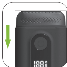
3. Assemble the Blade Heads Back to The Body

If you need to remove and wash the blades, it is recommended for a professional to operate and ensure all blades and blade meshes do not switch positions. Install them back into their original positions. Failing to do so may cause increased noise, weakened shaving effect, and uneven operation.