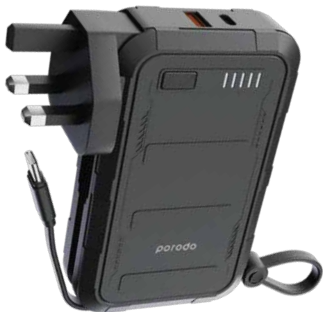
Wall Charger Power Bank