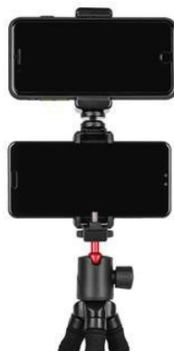
Adding a phone to the installation