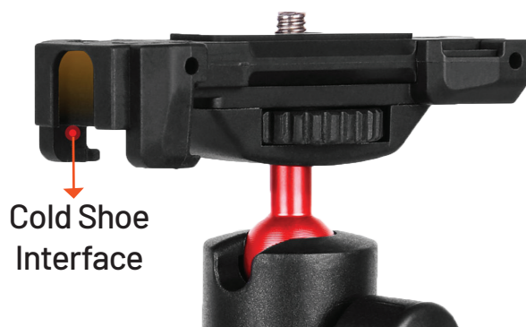
Cold Shoe Interface