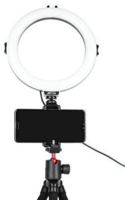
Adding a ring light to the installation

The tripod's mobile phone clip unfolds by an integrated cold shoe feature, allowing for the attachment of devices and various accessories such as microphones or ring lights.